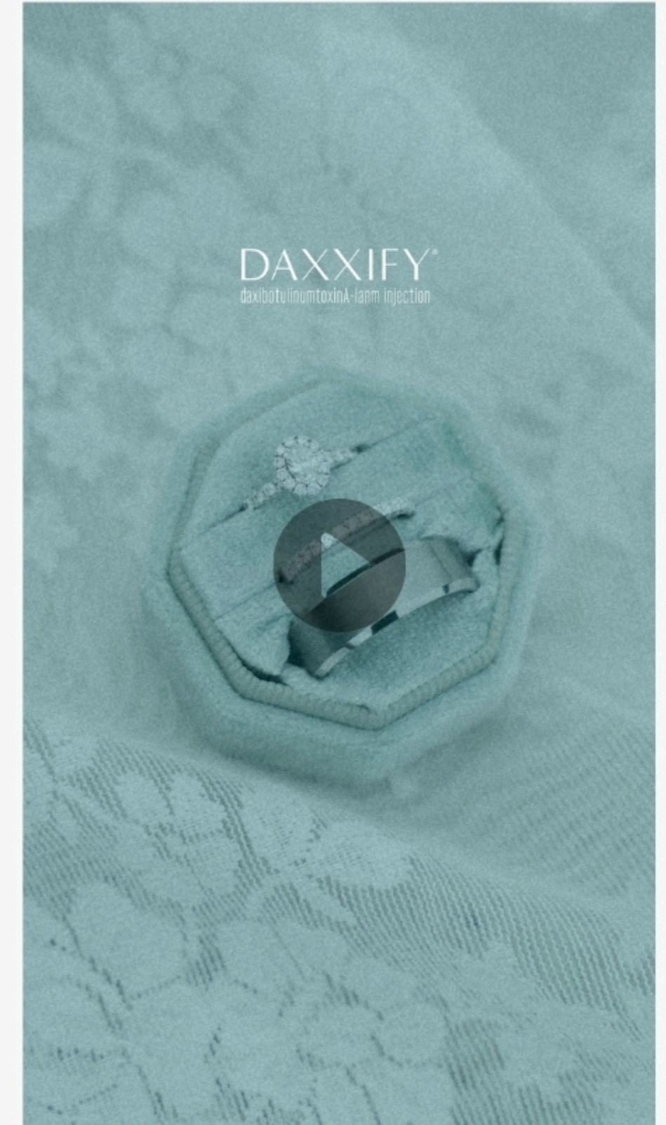
REEL WITH ISI