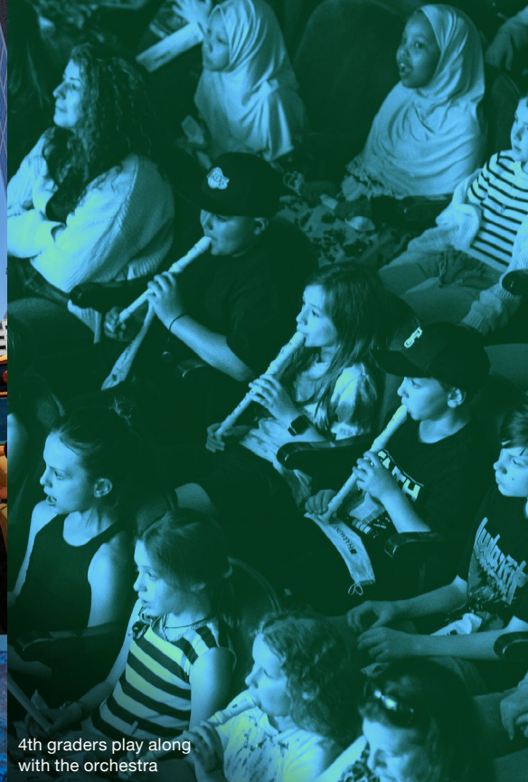
4th graders play along with the orchestra