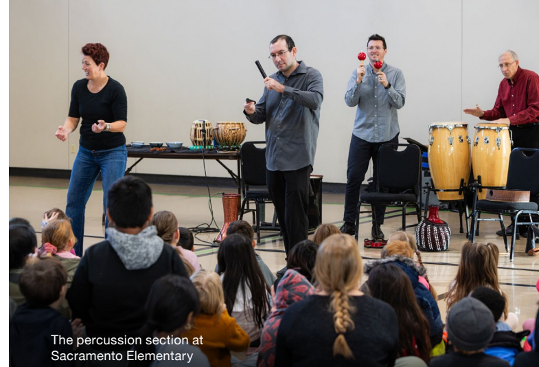
The percussion section at Sacramento Elementary

Another 8,000 students in grades 3–5 learn to sing songs and play the recorder throughout the year, culminating in a field trip to perform their songs alongside the Oregon Symphony in three Link Up performances. These programs and the corresponding curriculum are provided for free or at low cost to schools and families.