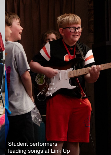
Student performers leading songs at Link Up