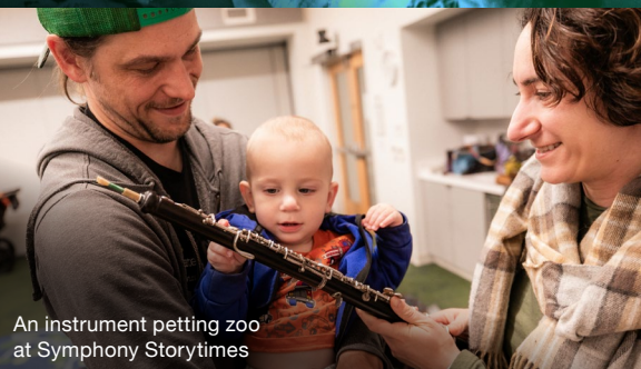
An instrument petting zoo at Symphony Storytimes