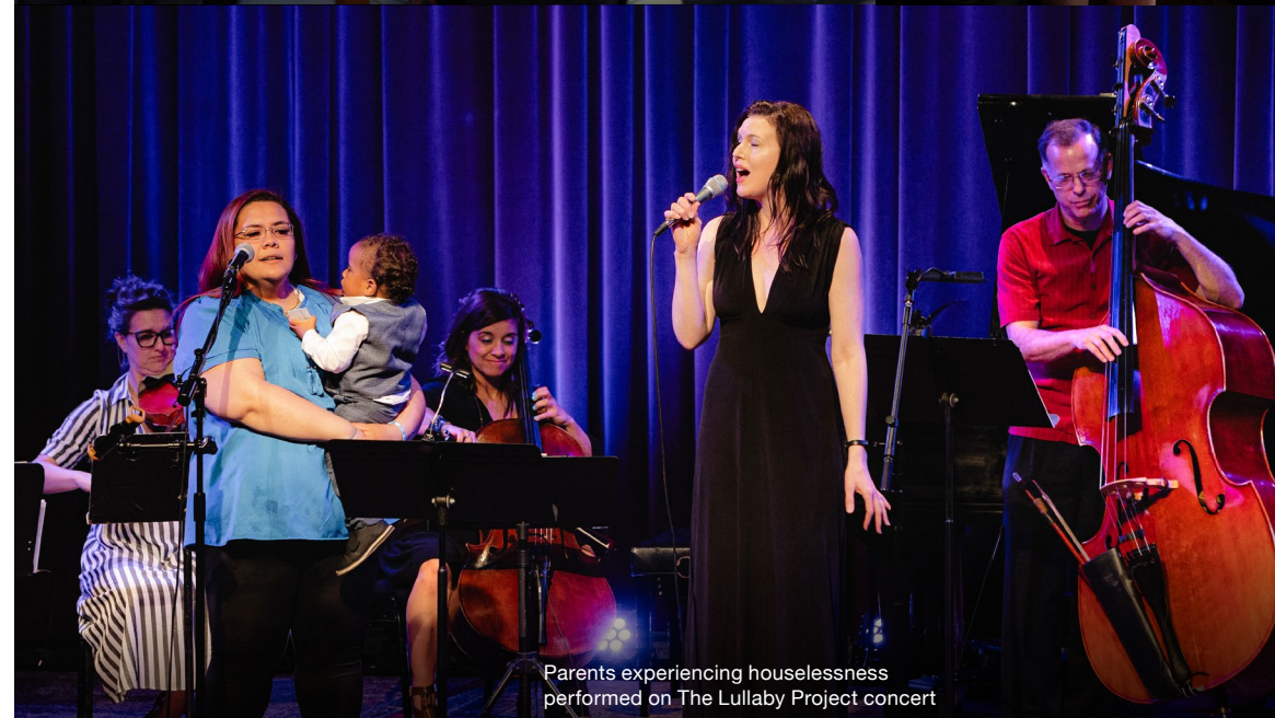
Parents experiencing houselessness performed on The Lullaby Project concert