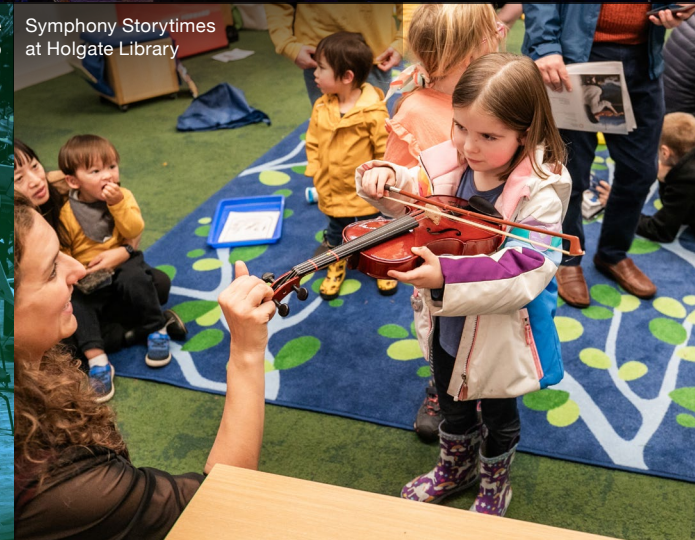
Symphony Storytimes at Holgate Library