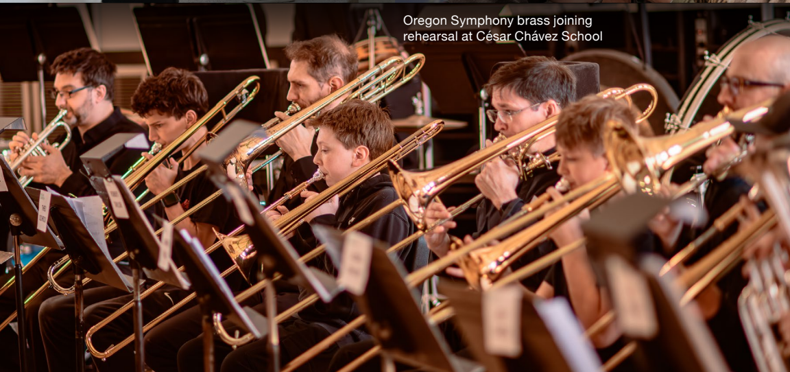
Oregon Symphony brass joining rehearsal at César Chávez School