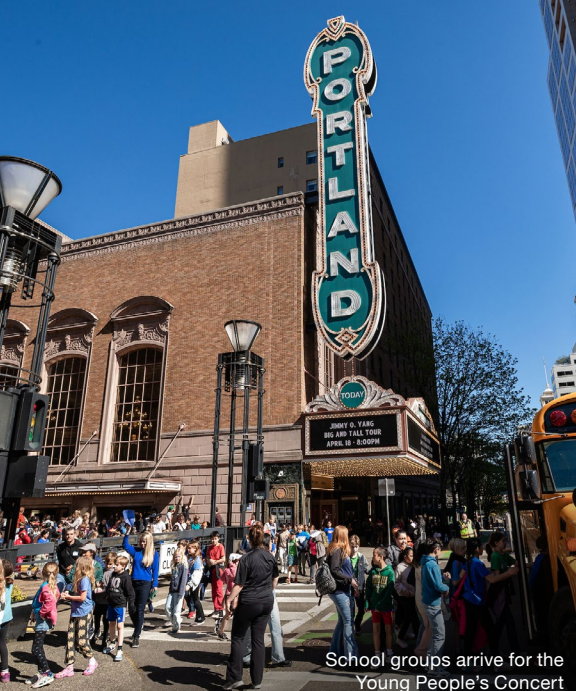
School groups arrive for the Young People's Concert

Oregon Symphony musicians partner with Earthtones Northwest Music Therapy to present interactive, music therapy-informed sessions of beautiful music, relaxing movement, and joy in memory care facilities and centers serving adults with disabilities.